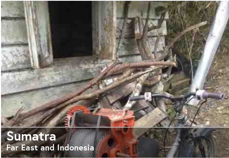
Sumatra Far East and Indonesia